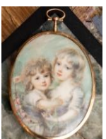
Portrait of Ladies Georgiana and Harriet Cavendish, daughters of the 5 th Duke of Devonshire, around 1850. Watercolour on ivory. British School, after Richard Cosway.

Georgiana floats towards us, nestled in the crescent curve of the clouds. Her dress is modelled on ancient Greek fashion and the crescent moon in her headband most likely refers to the Goddess Diana; goddess of the hunt, the moon, and chastity, among other things.