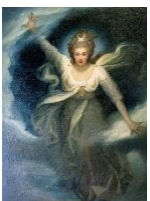
Portrait of Georgiana Spencer, Duchess of Devonshire as Diana by Maria Cosway, 1781-1782. Oil on canvas.